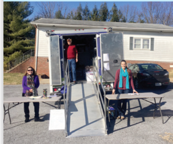
Catholic Charities staff and volunteers set up the van to distribute donated goods to families in need.

This past December, the St. John Bosco Outreach Center in Woodstock, Virginia welcomed the new Mobile Response Center to provide donated goods to the community.