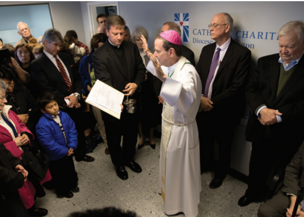
Bishop Michael F. Burbidge blesses the new Mother of Mercy Free Medical Clinic in Manassas on the first World Day of the Poor, November 19, 2017.

IF YOU LIVE IN MANASSAS PARK OR Manassas, you have a one-in-six chance of lacking health insurance. In fact, that's the highest rate of uninsured across the more than 6,500 square miles that Catholic Charities of the Diocese of Arlington (CCDA) serves. Without insurance, even the most basic medical care is unattainable.