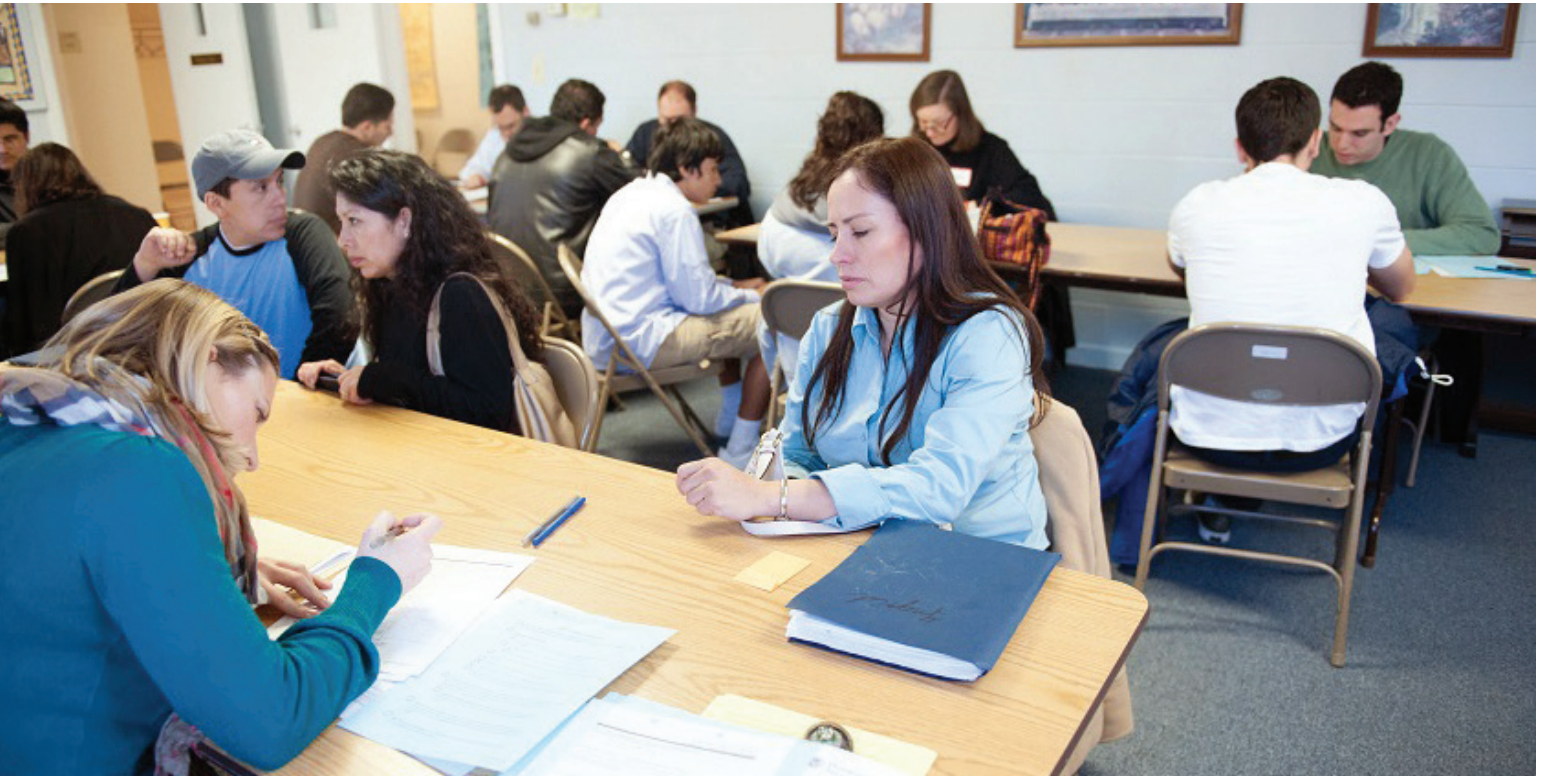
Volunteers assist lawful permanent residents (“green card holders”) complete the application and other forms required to become American citizens at a recent naturalization workshop.