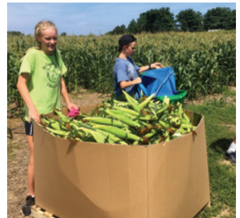
The corn collected was left in the husk to keep it from getting damaged during transport to three Catholic Charities pantries and several partner pantries.

From there, the corn was distributed to three Catholic Charities pantries, Loaves & Fishes Pantry in Front Royal, Warren County; Christ House in Alexandria city; and the Leesburg Pantry in Loudoun County. It was also sent to partner pantries in the following counties and cities: Rappahannock, Shenandoah, Winchester City, Madison County, Orange County, Fairfax County, and Arlington. In addition, Healthy Harvest Foodbank is distributing some of the corn to the Northern Neck.