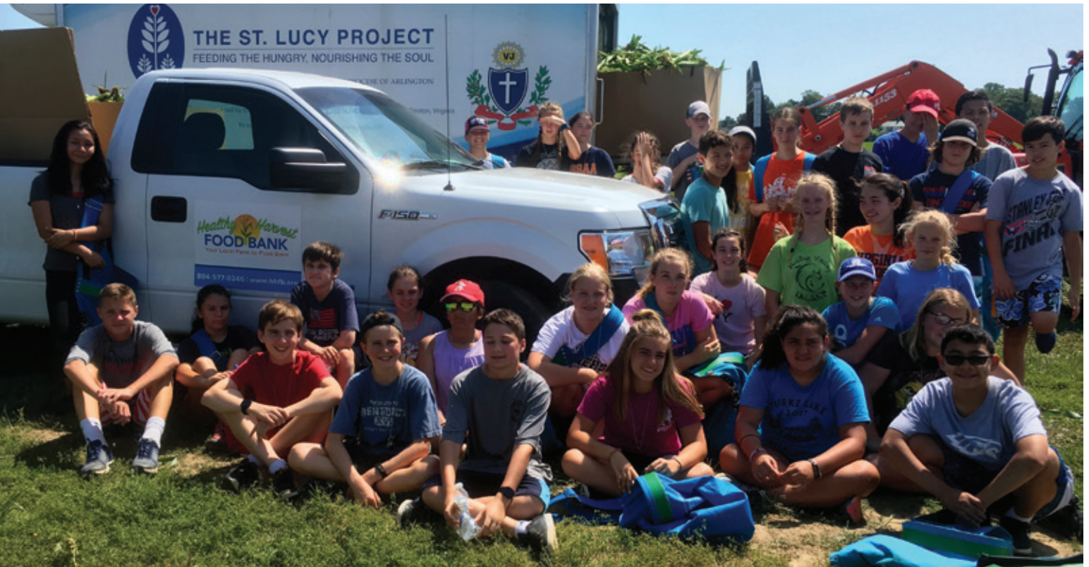
Students take a much needed break and pose for a photo after spending over two hours picking 10,294 pounds of corn.

FAMILIES SERVED THROUGH CATHOLIC Charities' St. Lucy Food Project got a healthy boost on a hot summer's day after 77 middle-school students spent two hours picking corn for the poor at Chandler Farms in Montross, Virginia, and Parker Farms in Colonial Beach, Virginia.