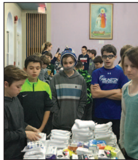
St. Ann 6th and 7th grade Religious Education Students help pack “Welcome Back” backpacks for ex-offenders being assisted by TAP.