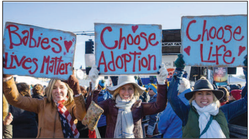
Women hold up signs advocating for adoption at the 2017 March for Life.

In addition to advocating for adoption, you can support your local crisis pregnancy centers and pregnant