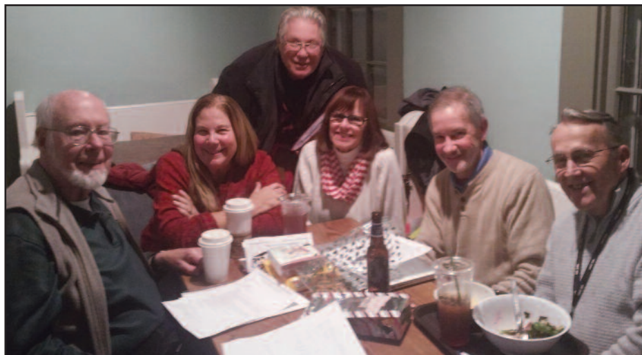
TAP volunteers meet monthly to discuss how best to help recently released prisoners.

At the very least, TAP ensures that someone is there to meet the ex-offender at the gate upon his or her release, share a meal and prayer, and get them to their place of relocation or to a bus or train to take them there. TAP can also provide a more extensive re-entry plan that arranges for reunification with family, and supports trips