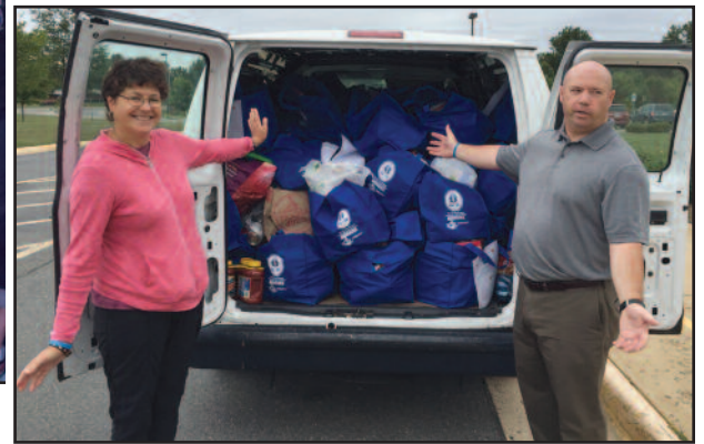
St. Katherine Drexel parishioners collecting St. Lucy Project blue bags of food (below).

T hese parishes have given in a variety of ways, including parish-wide food drives, school food drives, and youth and young adult service projects. Thank you to all parishes who continue to support the St. Lucy Project in feeding the hungry!