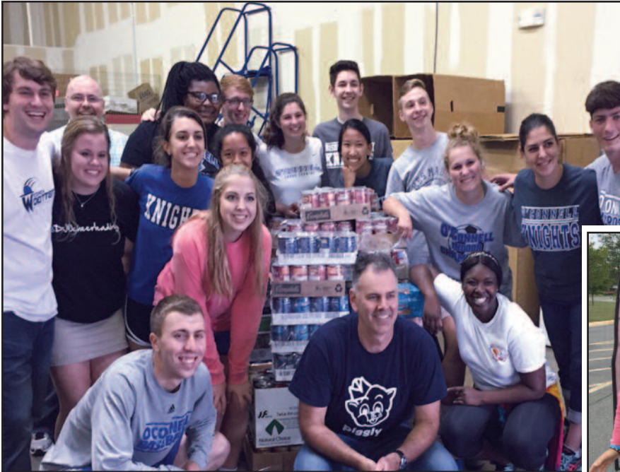
Bishop O'Connell students help deliver food from their annual canned soup drive (left).