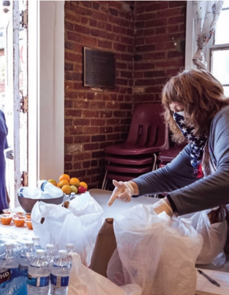
A volunteer prepares a to-go dinner for a client at Christ House's evening meal program.

S INCE THE PANDEMIC HIT VIRGINIA, our St. Lucy Food Project has been working hard to keep the food pantry shelves stocked to meet an ever-increasing need to feed families throughout our diocese.