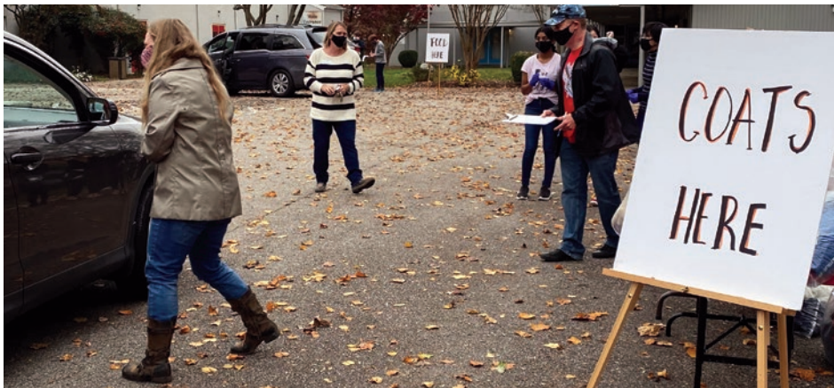
Catholic Charities staff and volunteers distributed winter coats, hats and gloves to people in a drive-thru distribution.

B EFORE IT OFFICIALLY OPENED ITS doors on Nov. 23, Catholic Charities’ Mother of Mercy Free Medical Clinic in Woodbridge hosted its first event to help members of the local community meet critical needs brought on by COVID-19 and the approaching winter.