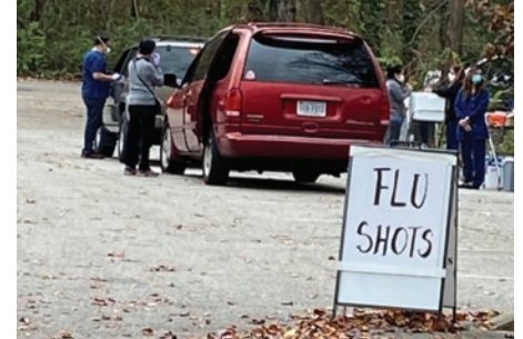
Medical volunteers gave free flu shots to people who didn't have to get out of their cars.

St. Lucy Food Project food drives held at Nativity, St. Ambrose and Good Shepherd parishes also marked the day.