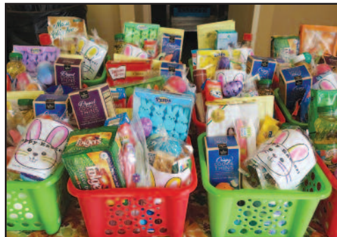
Students packing Easter bags with donated goods they brought in.