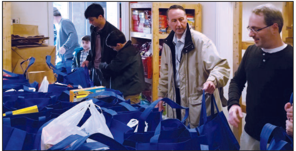
St. Jude parishioners unloading food to St. Faustina's Pantry in Fredericksburg.

Additionally, we welcomed many new families into the warehouse for this Lenten food drive season. Students served for confirmation hours, and school service hours. On March 12, the Squire Roses from Holy Spirit School provided the heavy lifting, and