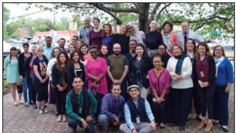
Migration and Refugee Services Volunteers